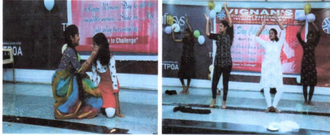
Skit and Dance performances